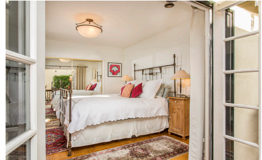
North of Montana * 3 BR 2 BA Main House * Guest House * 2 car garage

Drought resistant landscaping, towering hedges on each side of the lot, and first time on the market in 20+ years... Amazing walkability to Whole Foods, Yoga Works, Aero Theatre, shopping, dining, beach and some of the best public schools in LA.