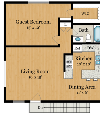
GUEST HOUSE (ABOVE DETACHED GARAGE) 790 SQ FT

Estimated Total Finished Square Footage: 2,635 SQ FT Above-Grade: 2,635 SQ FT Below-Grade: N/A